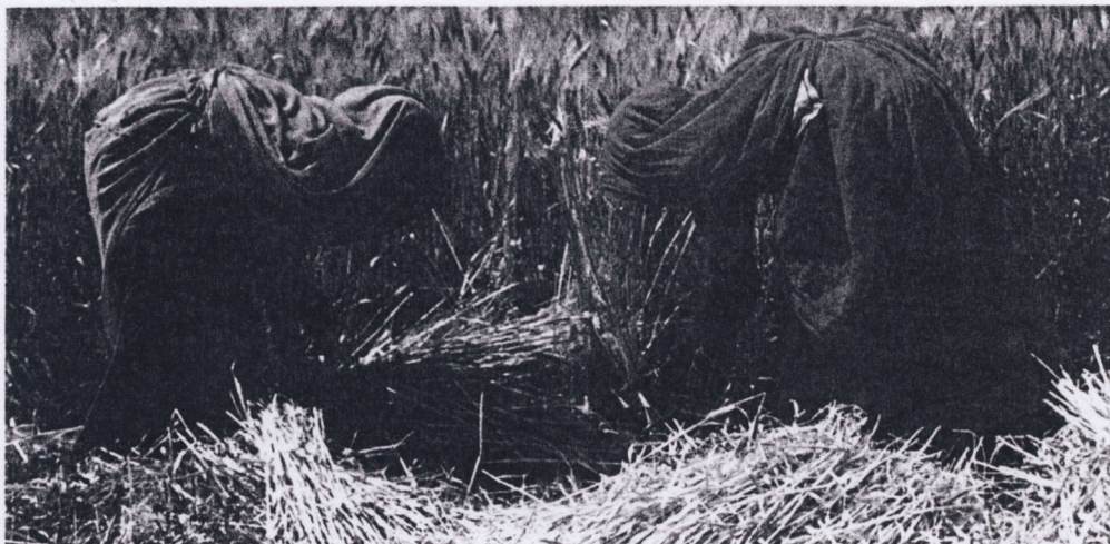
No need to starve