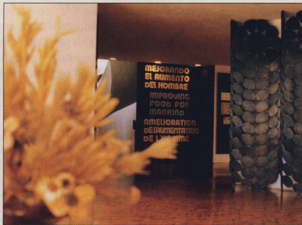
Figure 8.D The CIYMMT headquarters The Centro Internacional de Mejoramiento de Maíz y Trigo (CIMMYT) (International Center for the Improvement of Maize and Wheat) in Texcoco, Mexico, is involved in plant breeding and research. High-yield-variety seeds were developed here for the Green Revolution. The center holds the world's premiere collection of corn and wheat germplasm. Modern, refrigerated storage vaults store many thousands of varieties. Today, in addition to the static, cold storage, scientists are working with farmers to preserve seeds dynamically.

The initial focus of the green revolution was on the development of seed varieties that would produce higher yields than those traditionally used in the target areas. However, in developing new, higher yielding varieties, agricultural scientists soon discovered that plants were limited in the amount of nitrogen they could absorb and use. The scientists' solution was to increase the nitrogen absorption capacity of plants by delivering nitrogen-based fertilizers in water (this led to the need to build major water and irrigation development projects). Then the scientists discovered that the increased nitrogen and water caused the plants to develop tall stalks.