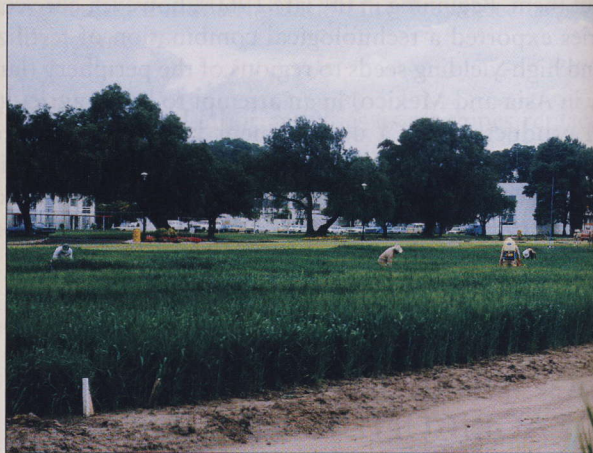
Figure 8.E Green revolution experimental plots The CIMMYT includes numerous plots for breeding and testing seed varieties.

Thanks to green revolution innovations, rice production in Asia grew 66 percent between 1965 and 1985. India, for example, became largely self-sufficient in rice and wheat by the 1980s. Worldwide, green revolution seeds and agricultural techniques accounted for almost 90 percent of the increase in world grain output in the 1960s and about 70 percent in the 1970s. In the late 1980s and 1990s at least 80 percent of the additional production of grains could be attributed to the use of green revolution techniques. Figure 8.F