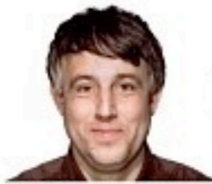
BELGIË BELGIEN BELGIUM