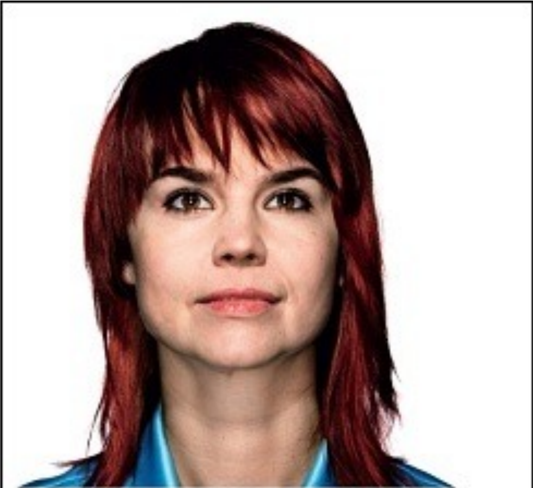
EESTI ESTLAND ESTONIA