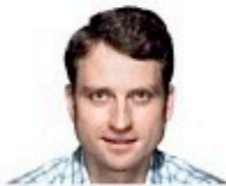
SLOVENSKO SLOWAKI SLOVAKIA