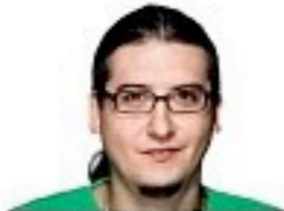
ROMÂNIA ROMANIEN ROMANIA