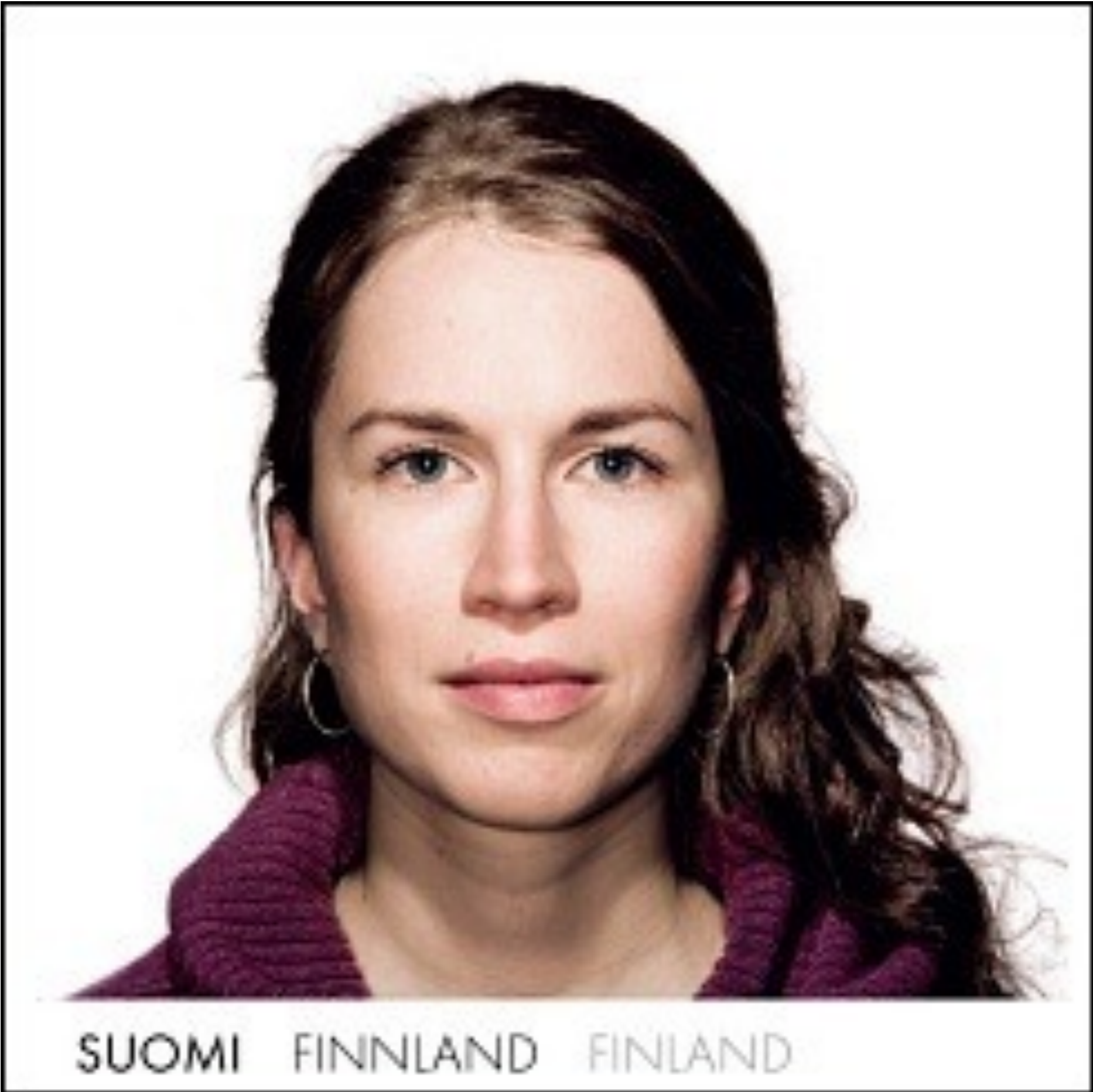
SUOMI FINNLAND FINLAND