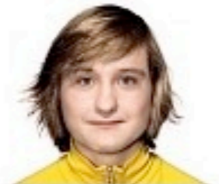
LATVIA LETLAND LATVIA