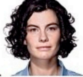
MAGYARORSZÁG HUNGARI HUNGARY