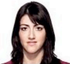
PORTUGAL PORTUGAL PORTUGAL