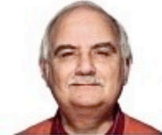
MAĊTA MALTA MALTA