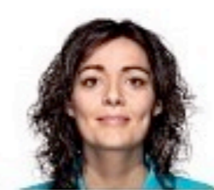
LUXEMBOURG LUXEMBURG LUXEMBOURG