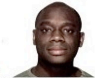
FRANCE FRANKREICH FRANCE