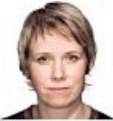
ČESKÁ REPUBLIKA TSCHECHEN CZECH REPUBLIC