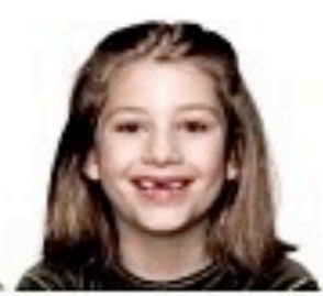
ΕΛΛΑΔΑ GRECHENLAND GREECE