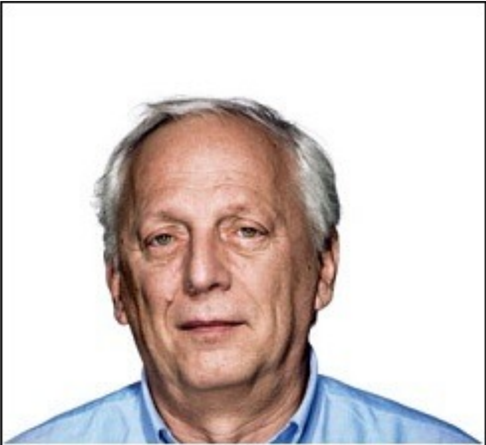
ITALIA ITALIEN ITALY