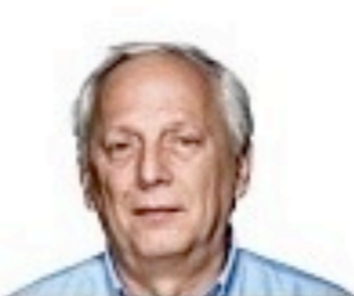
IRISH IRELAND IRE