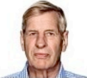
ÍSLEIÐ ISLAND ISLAND