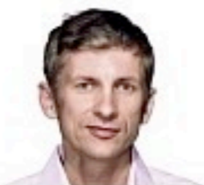
LITVA LIJEN LITHUANIA