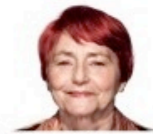
SILOVENIJA SLOVENIEN SLOVENIA