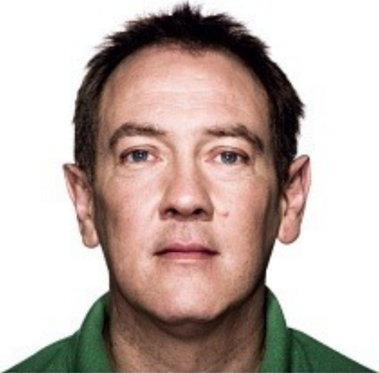
DANMARK DÄNEMARK DENMARK