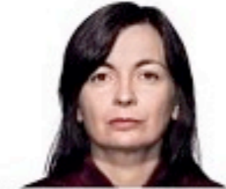
NEDERLAND NEDERLANDE NETHERLANDS