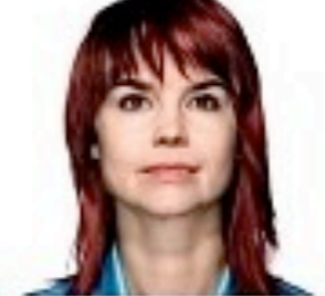
EESTI ESTLAND ESTONIA