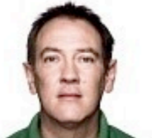
DANMARK DÄNEMARK DENMARK