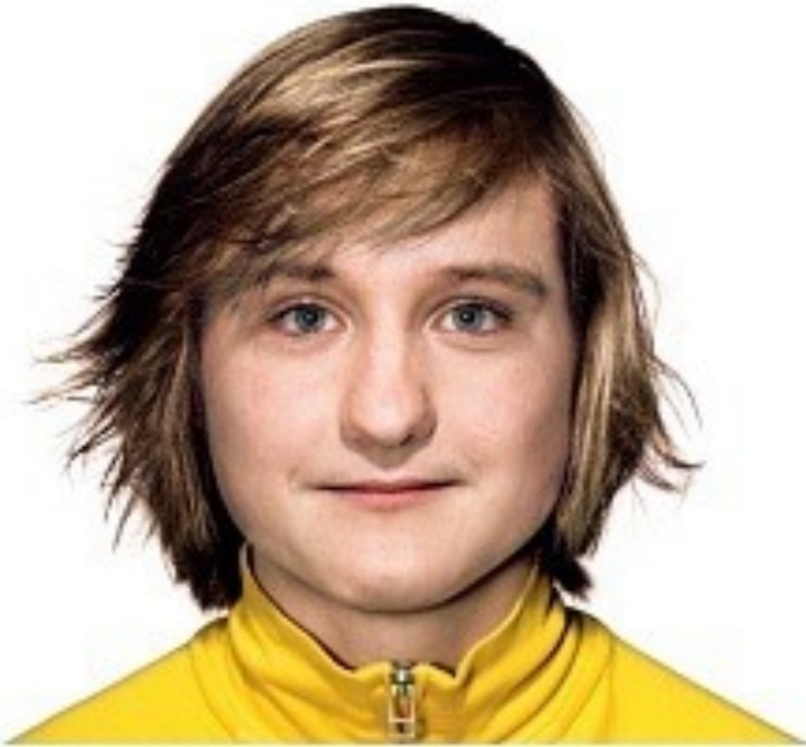
LATVIJA LETTLAND LATVIA