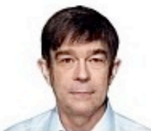
POLSKA POJEN POLAND