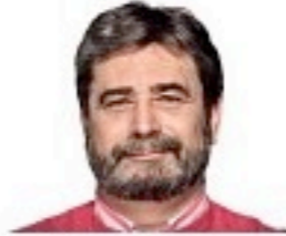
ESPAÑA SPANIEN SPAIN