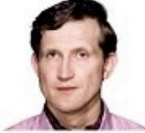
UNITED KINGDOM VERENIGDE KONINKRIJK