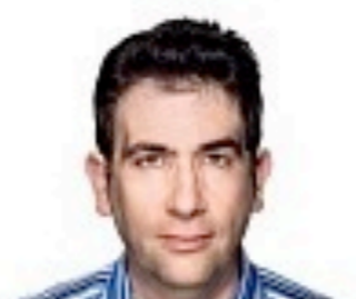
BULGARIA BULGARIEN BULGARIA