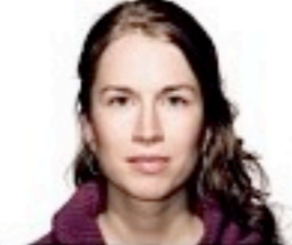
SUOMI FINLAND FINLAND