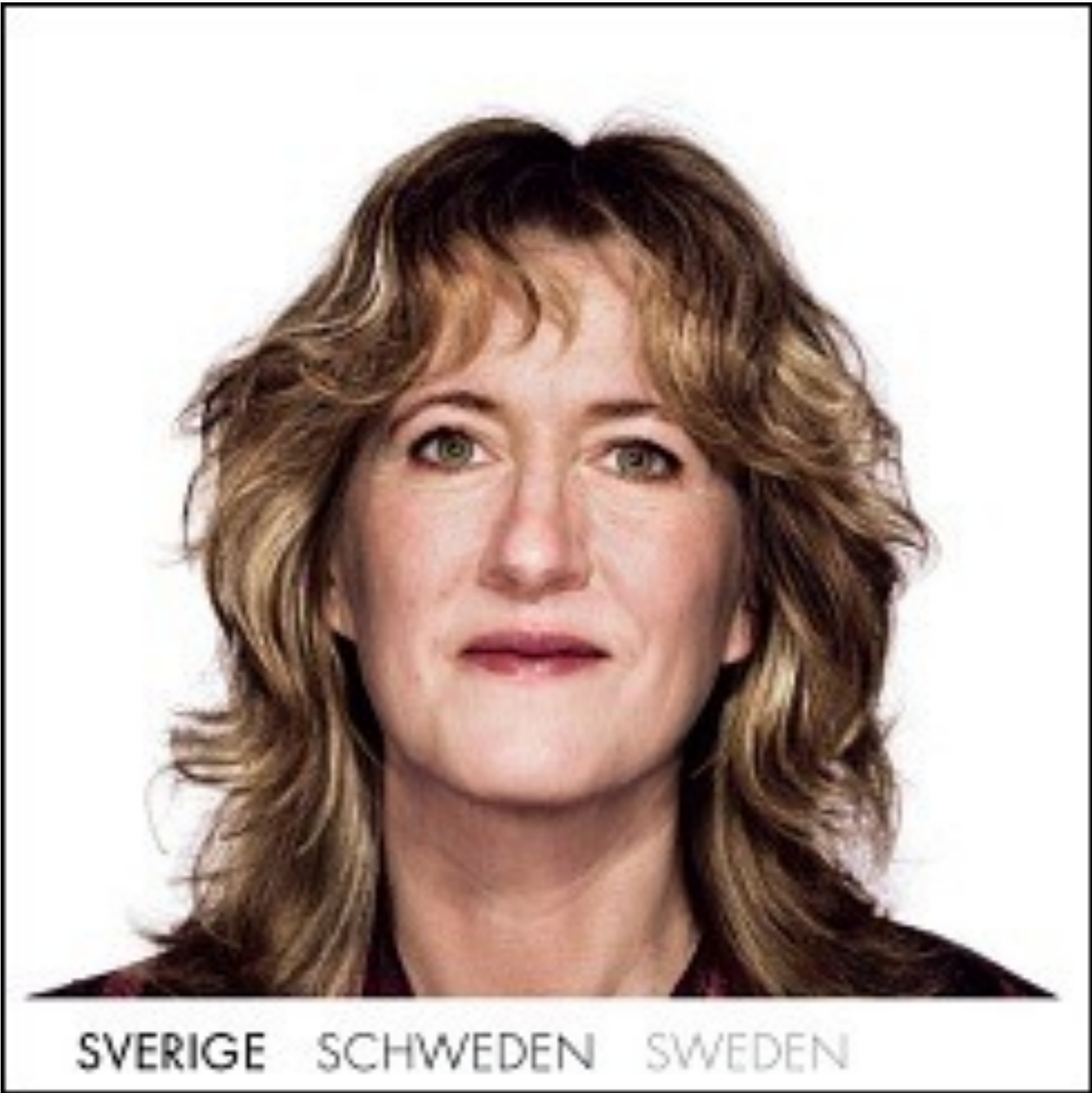
SVERIGE SCHWEDEN SWEDEN