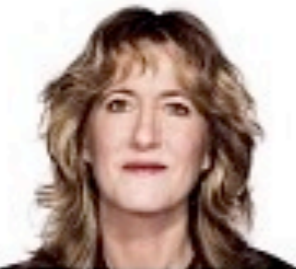
SVERIGE SCHWEDEN SWEDEN