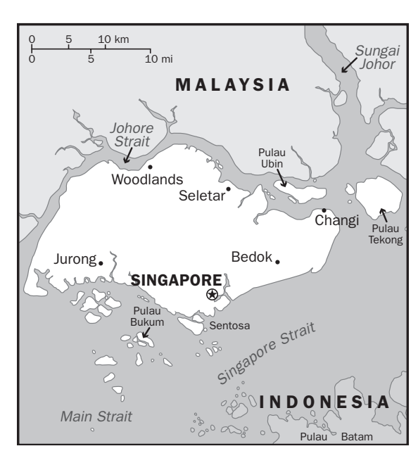
Figure 1: Map of Singapore

On the sixth of February, 1819, Sir Stamford Raffles, lieutenant governor of Bencoolen, closed a deal with Sultan Hussein of Johor and the Temenggong Abdu'r Rahman, the local rulers. The deal secured a trading post for the British East India Company on an island off the southern tip of the Malay Peninsula (see Figure 1). On that day, Sir Raffles become known as the founding father of Singapore, a country that today is ranked the most globally integrated place on Earth.