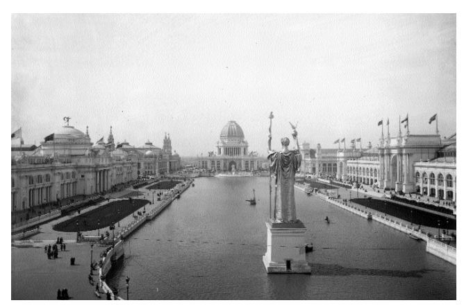
A view of the "White City", as the World's Columbian Exposition was known.

In the late 1800s and early 1900s, expositions and fairs were a way of educating people not only about their nation and its place in the world but also about their own place in American society. In 1893, over 27 million people attended the World's Columbian Exposition—an exposition that used architecture, artifacts, and "living exhibits" to celebrate "American progress." Held in Chicago to mark the 400th anniversary of Christopher Columbus's voyages to the Americas, it attracted over 13 million Americans—about one of every five people in the nation. The fair was designed to prove that "the wonderful progress of the United States, as well as the character of the people," is the result of natural selection. Many of the exhibits illustrated "the steps of progress of civilization and its arts in successive centuries, and in all lands up to the present time." The aim was "to teach a lesson; to show the advancement of evolution of man." That lesson was rooted in social Darwinism—the idea that competition rewards "the strong" (Chapter 3).