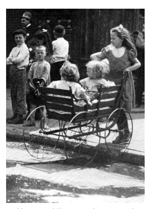
Detail from "Street children, New York City, c. 1908" by Lewis Hine.

With . . . one dollar a day [our mother] fed and clothed an ever-growing family. She took in boarders. Sometimes this helped; at other times it added to the burden of living. Boarders were often out of work and penniless; how could one turn a hungry man out? She made all our clothes. She walked blocks to reach a place where meat was a penny cheaper, where bread was a half-cent less. She collected boxes and old wood to burn in the stove instead of costly coal. Her hands became hardened and the lines so begrimed that for years she never had perfectly clean hands. One by one she lost her teeth—there was no money for dentists—and her cheeks caved